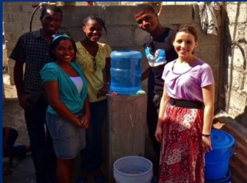
BioBubbler Sustainable Environment, 2014