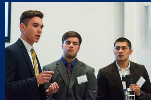
OTTOnomous Technology Innovative Technology, 2014