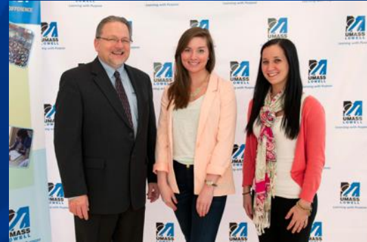
Healthy Habits Significant Social Impact, 2013