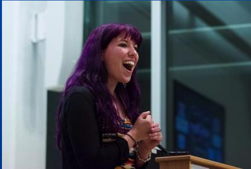
Fresh Beets First To Market, 2014