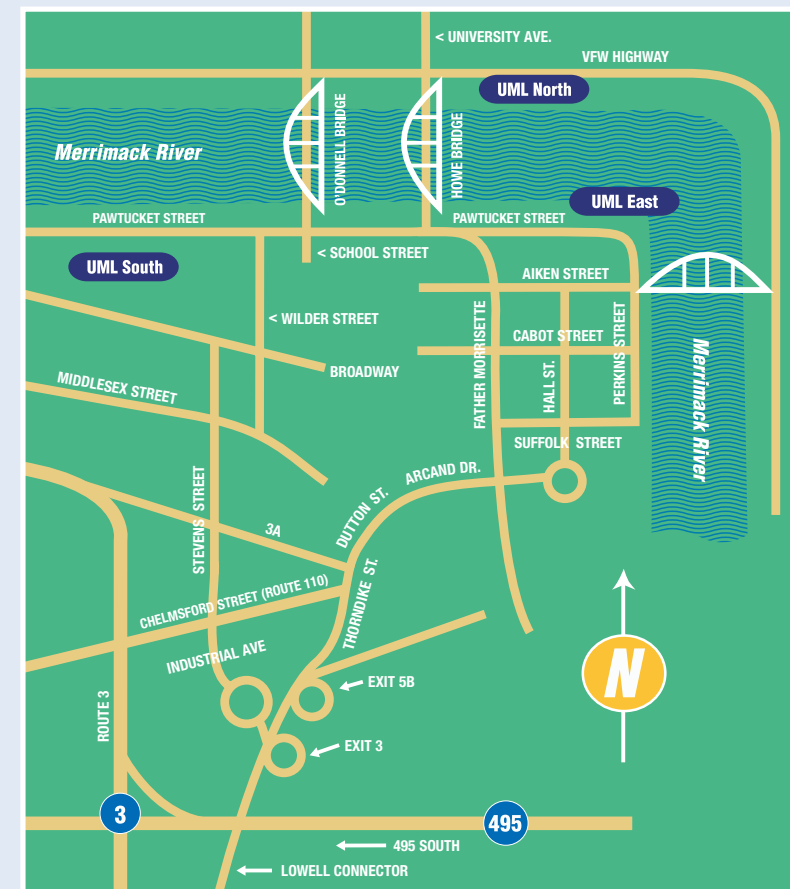
Relative distances have been distorted to provide space for additional map details.

Turn left at the traffic light onto Father Morissette Boulevard. Wannalancit Mills is one block on the right. Proceed to the second light at Aiken Street and take a right to reach UMass Lowell East, LeLacheur Park and the Campus Recreation Center. For North Campus, continue to the third light (University Crossing is on your left) and turn right onto the Howe Bridge. Once across the bridge, North Campus is on either side of the street.