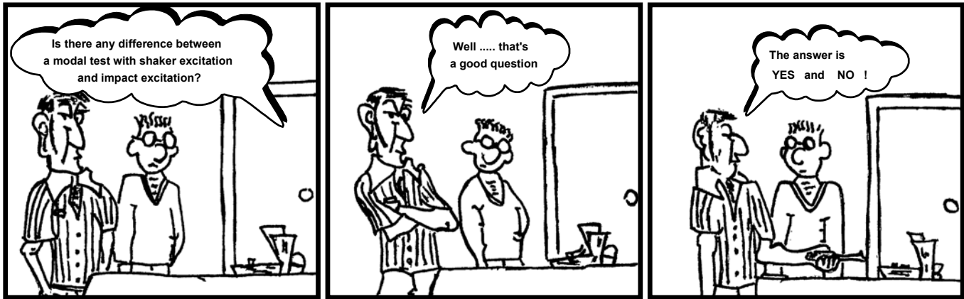
Illustration by Mike Avitabile

Is there any difference between a modal test with a shaker excitation or impact excitation? Well ... that's a good question. The answer is yes and no.