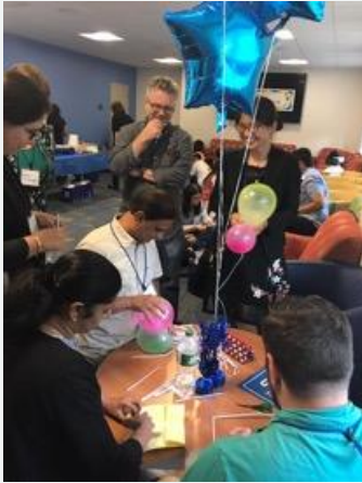
Students and faculty from different institutions came together to take on the task of creating a safety cushion for their egg, many of which were proved successful.