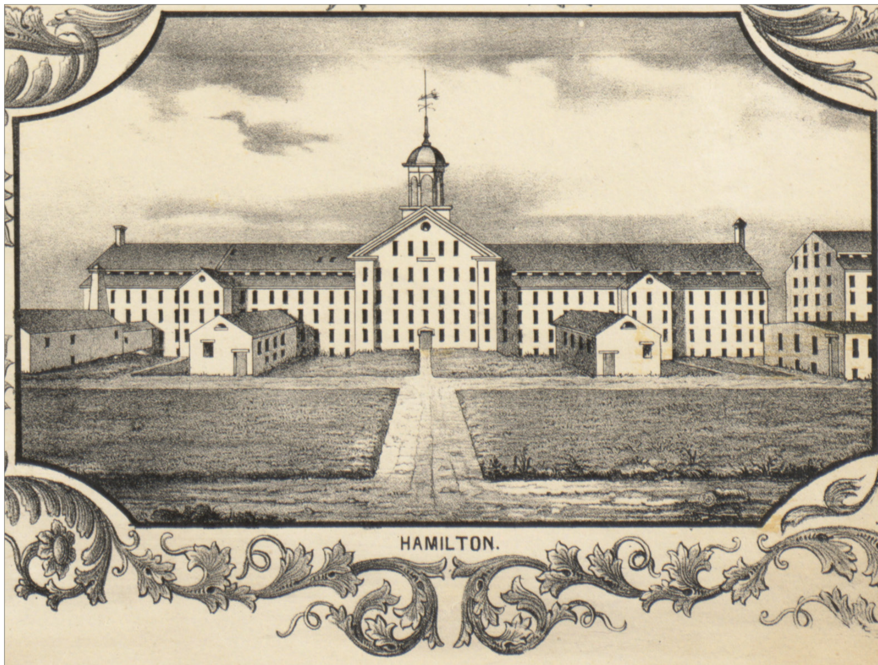
Plan of the City of Lowell, Massachusetts, Hamilton Mill detail, 1850