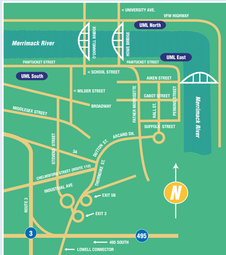
Relative distances have been distorted to provide space for additional map details.

Turn left at the traffic light onto Father Morissette Boulevard. Wannalancit Mills is one block on the right. Proceed to the second light at Aiken Street and take a right to reach UMass Lowell East, LeLacheur Park and the Campus Recreation Center. For North Campus, continue to the third light (University Crossing is on your left) and turn right onto the Howe Bridge. Once across the bridge, North Campus is on either side of the street.