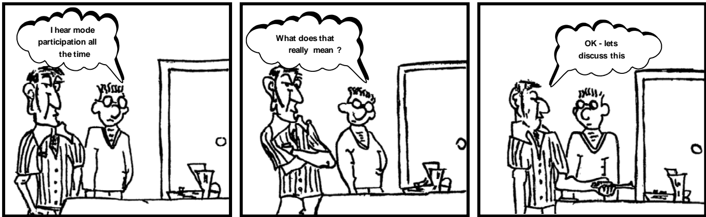
Illustration by Mike Avitabile

I hear mode participation all the time. What does that really mean? OK – let’s discuss this.