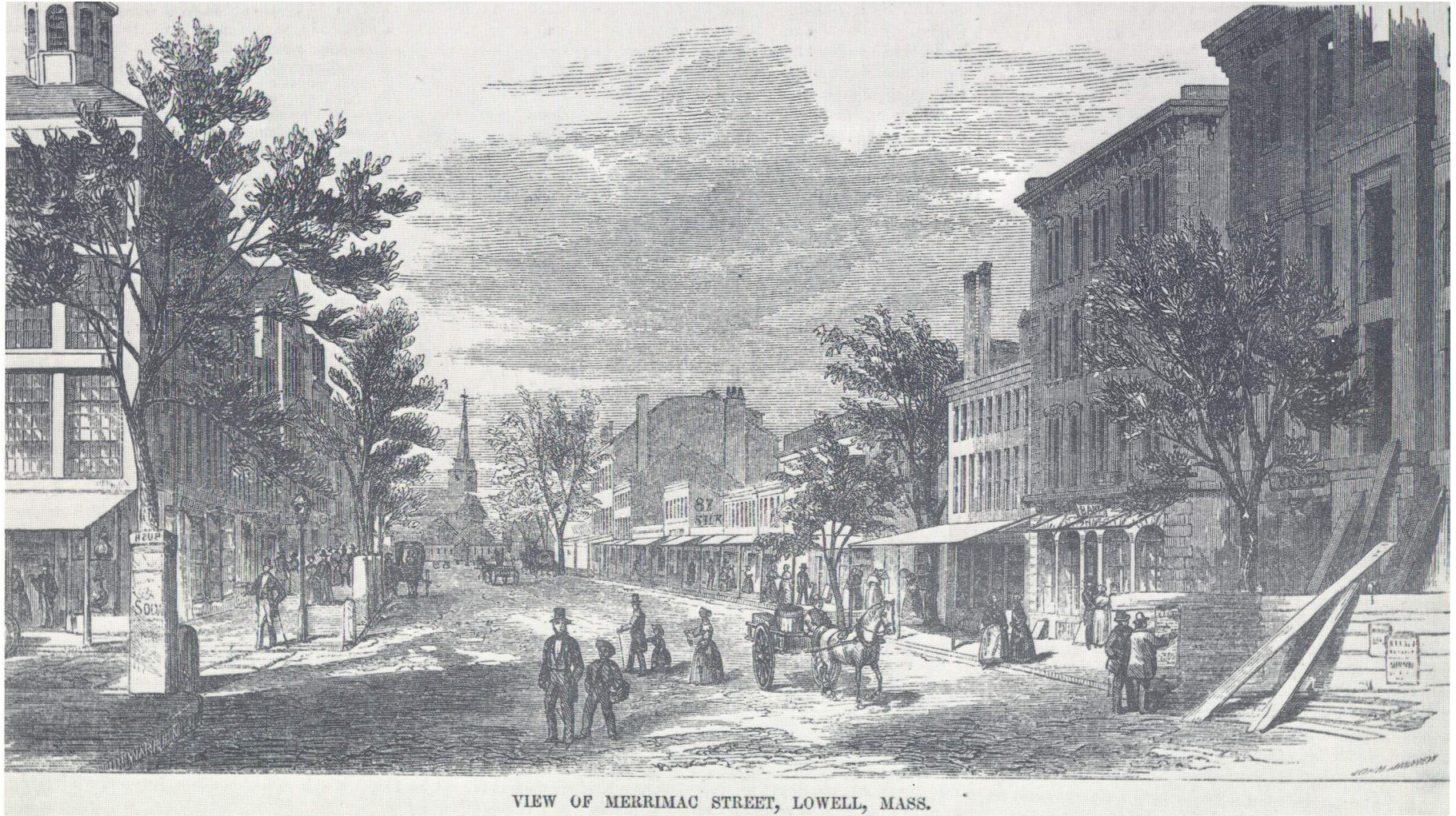
VIEW OF MERRIMAC STREET, LOWELL, MASS.

Merrimack Street was, and still is, Lowell's main street for shopping, dining, and other social events.