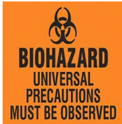
Figure 1b: Biohazard Label (Universal Precautions)