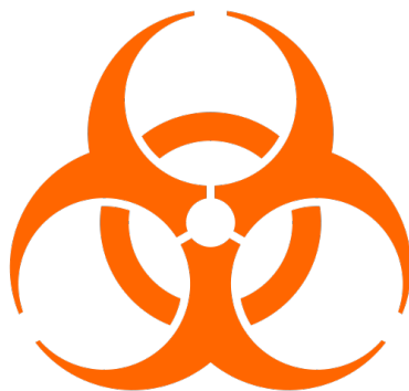
Figure 1a: The Biohazard symbol