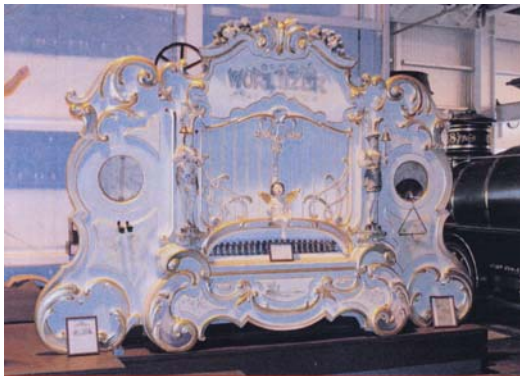
Wurlitzer style 165 Military Band Organ which will play both the Star Spangled Banner and American Patrol

Next we saw a video highlighting each of a long list of patriotic songs, and each segment gave a biographical sketch of the composer, and the song was played by a mechanical organ. These organs that played the songs were