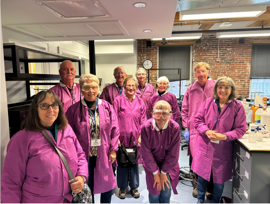
LIRA Members don protective clothing and goggles on the TURI tour

Following the LIRA presentation by TURI staff members on “Dispelling myths around disinfection, sanitization, and household cleaners,” 10 LIRA members toured the TURI Institute and had a hands-on opportunity to evaluate the effectiveness of various commercial and home-made stain removers. Located in the Boot Mill, the TURI Institute is a non-governmental agency affiliated with UMass Lowell. TURI works with commercial and governmental agencies to evaluate chemical toxicity and pollution potential.