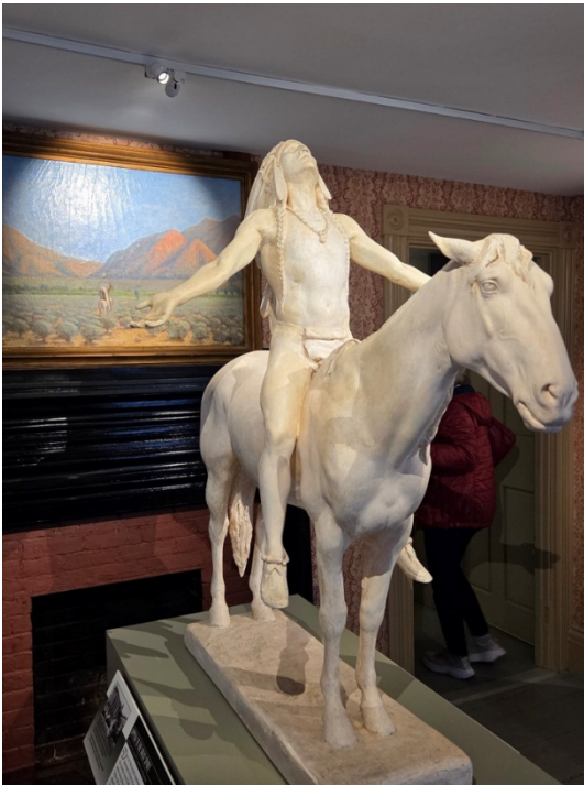
Plaster Mold for the "Appeal to the Great Spirit" /Boston Museum of Fine Arts Entrance, Cyrus Dallin 1908