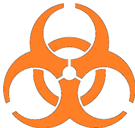
Figure 2: Universal Biohazard Symbol

All areas and laboratories which contain biohazardous agents must be posted with a biohazard sign. The sign must be red/orange in color with a biohazard symbol and should be located on lab doors, fridges, freezers (-20 and -80 degrees), storage and transportation containers and over all equipment used with biohazard materials.