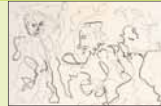
Kerouac Painting 16

More information: www.lowellcelebrateskerouac.org