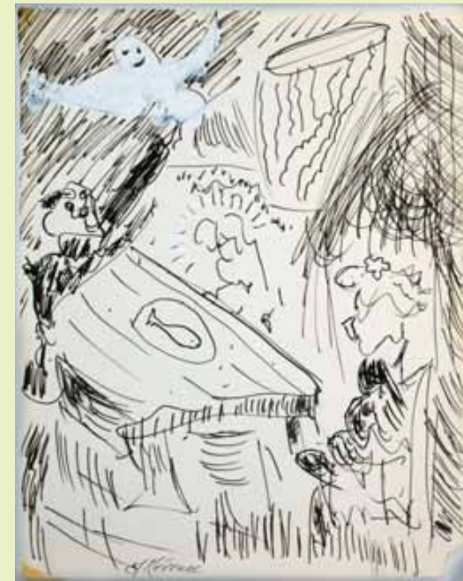
Kerouac Painting 12.