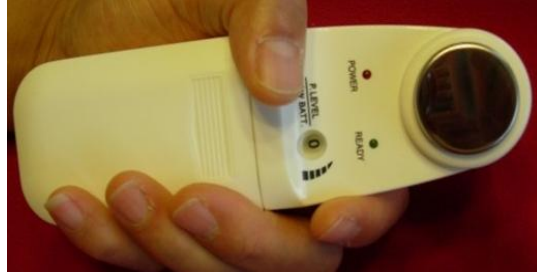
Model LD $69.95