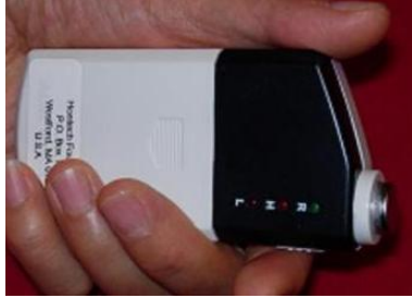
Model SM $59.95

Eliminate itch in 1 minute for 1 day Clear up rashes/redness quickly