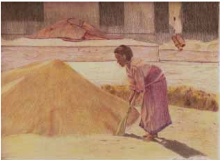
Bungamati, Nepal - "Drying Rice"