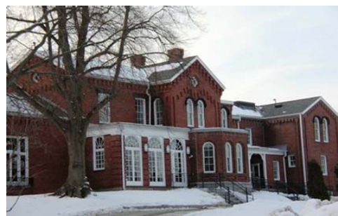
The Allen House

Recipient of the Nancy M. Valentine Excellence in Leadership Award in 2007.