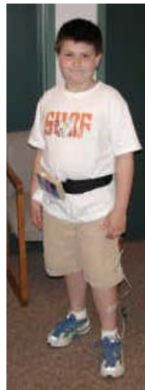
Child with step-sensing shoe device to help correct and improper gait.

The Assistive Technology Program is a large component of the initiative to integrate Service Learning throughout the College of Engineering.