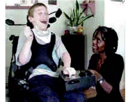
Electrical engineering student helping a client with his scanning control unit for home environment.