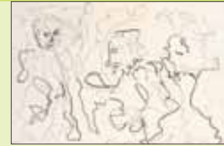
Kerouac Painting 16

Thursday, October 21 (the anniversary of Jack's passing) More information: www.lowellcelebrateskerouac.org