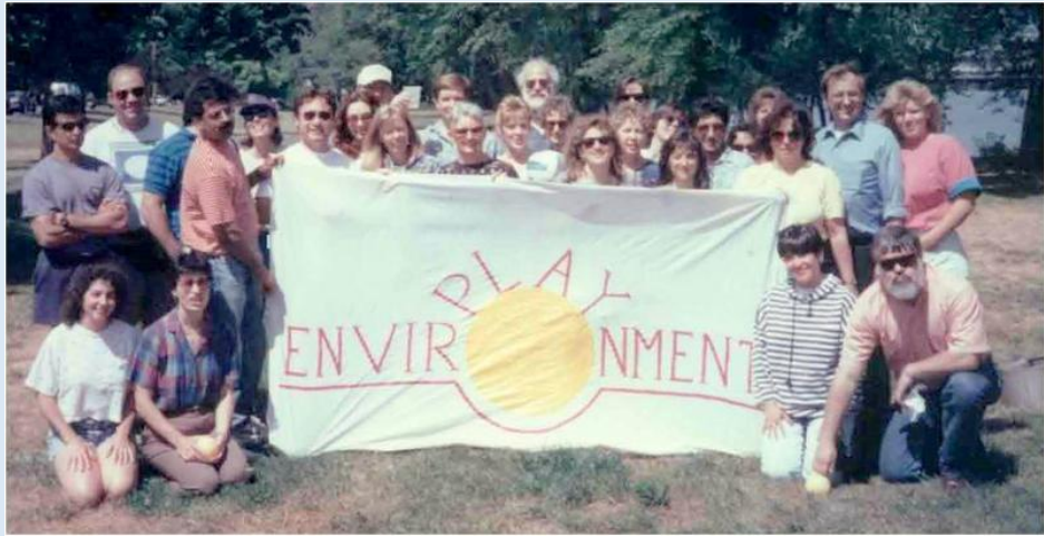
Department of Play Environment Picnic, 1995

are very appreciative of this visit and other opportunities in the field.