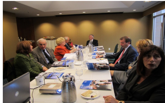
GSE Advisory Board Meeting

Established in 2003 to recognize outstanding graduates of UMass Lowell who have been admitted to a graduate program leading to education licensure. Priority consideration given to academic record, financial need, community service and interest in music or elementary education.