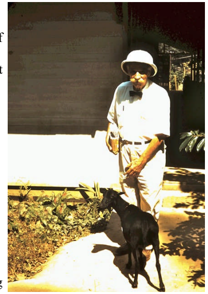
Dr. Albert Schweitzer, his goat and letters to answer.