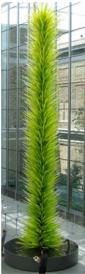
Lime Green Icicle Tower

The new art of the Americas Wing and the Dale Chihuly Exhibition drew LIRA members to Boston's Museum of Fine Arts on April 27. The Chihuly exhibit 'Through the Looking Glass' was truly spectacular with its bold and colorful pieces of large-scale glass sculpture.