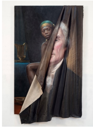
Beyond the Myth of Benevolence Titus Kaphar