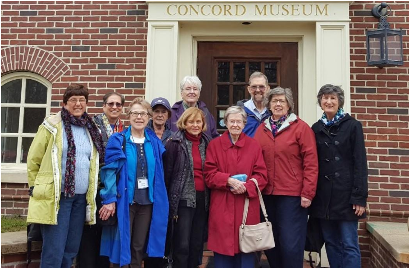
LIRA members visiting the Concord Museum